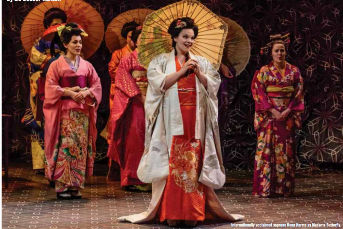
Internationally acclaimed soprano Rena Harms as Madama Butterfly.